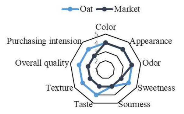
Figure 2: Mean scores obtained for sensory attributes of oat drinking yogurt T2 (selected among T1, T2, and T3) and commercial drinking yogurt.

The purpose of the second sensory evaluation was to compare the oat drinking yogurt selected from the first sensory evaluation to commercial yogurt. Color, appearance, taste, texture, overall quality, purchasing intention, odor, sweetness, and sourness did not differ significantly between the selected oat drinking yogurt and commercial yogurt (Figure 2).